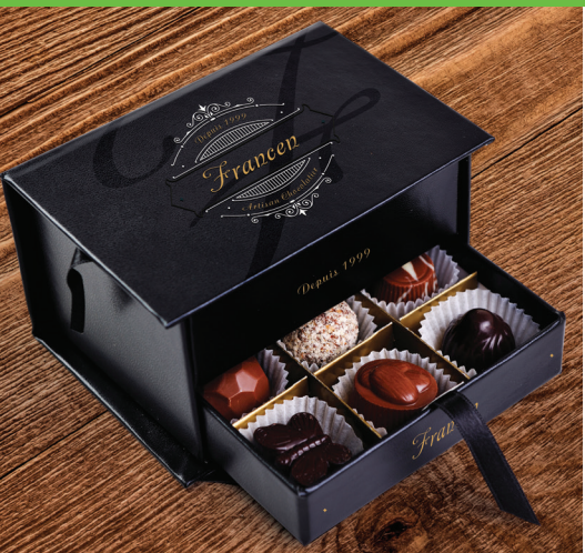
Compatible with a world of flexible media, bring your unique packaging vision to life with realistic proofs and prototypes.