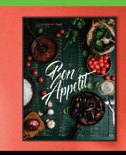
Customize panels, sheets, canvas, display boards and so much more with the ease, speed, and simplicity of direct-to-object printing.